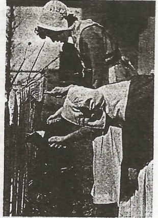
High school students in traditional Pennsylvania Dutch costume whitewashing hand split pale fence surrounding garden at Heckler farmstead.