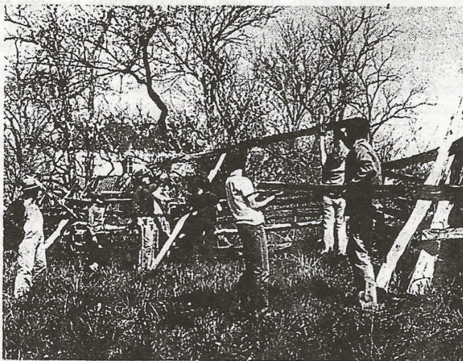
Erecting stake and rider fence with hand split rails at "Heckler Plains" farmstead, Lower Salford Township, Pennsylvania.