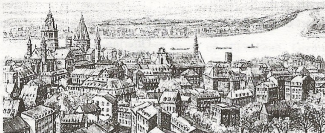
City of Mainz on the Rhine, Germany, capital of the Palatinate from which our Kulp ancestors came.