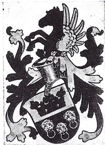
KULP COAT OF ARMS 1578