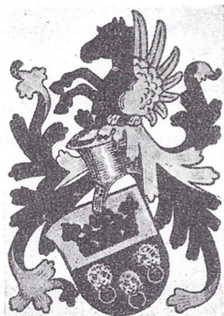
KULP COAT OF ARMS 1578

"Hate, the off-spring of atheistic communism, can be conquered by democracy, born of love; by a return to the spiritual ideals of our forefathers, by a reaffirmation of eternal principles, by loosing the shackles of greed for wealth and power."