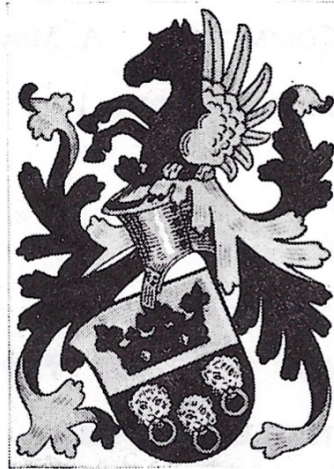
KULP COAT OF ARMS 1578

"Everything in the world changes; everything grows older; the streets, the houses, the people.