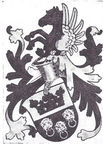
KULP COAT OF ARMS 1578

Today we are living in a troubled world; envy, jealousy and hatred among peoples and nations. The times are perilous and we know not what the morrow will bring forth.